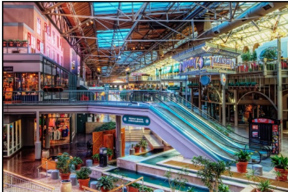
Photos: Above, hotel lobby 2010; Right, interior train shed mall 2010; map of track layout 1916

106 process under the National Historic Preservation Act. Section 106 requires that federal agencies identify historic properties and assess the effects of the projects they carry out, fund, or permit on those properties. Federal agencies also are required to consult with parties that have an interest in the historic property when adverse effects may occur.