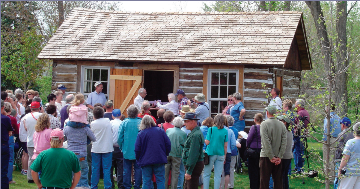
RESTORED FOUNDER'S CABIN, GREAT FALLS, MT